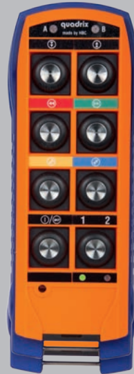
Version with trolley preselection.

Diverse cranes, lift equipment and machinery.