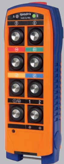
Version with LED feedback.